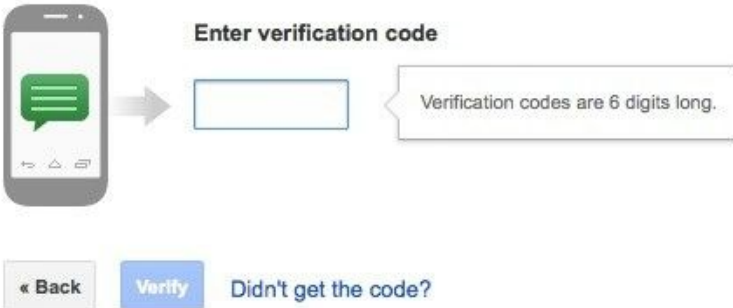
IMG-2 Verify your phone number by entering in the six-digit code Google sent you.

We sent a text message to [redacted] with a code